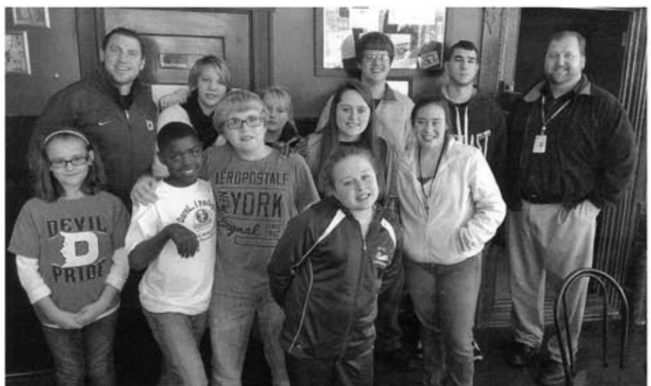
Congratulation to the November Students of the Month, who enjoyed pizza with the principals on December 13 at Buona Vita Pizzeria. Hard work does pay off!