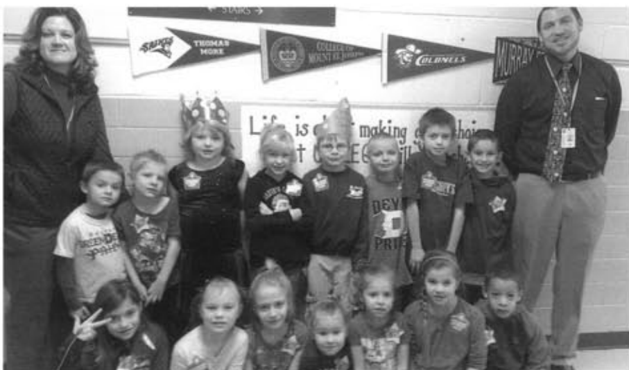
Congratulations to the LES November Stars of the Month who enjoyed pancakes with the principals on December 19. We are very proud of their hard work in the classroom!